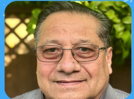
Deacon Rojo https://page.fund easy.com/7699075