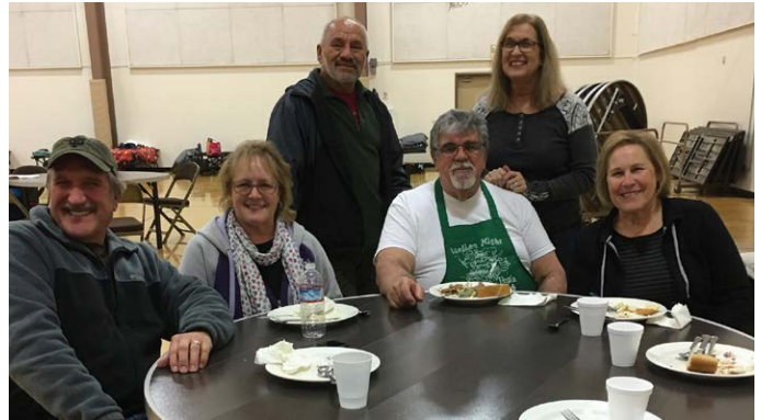
REST volunteers provided help prior to the pandemic.