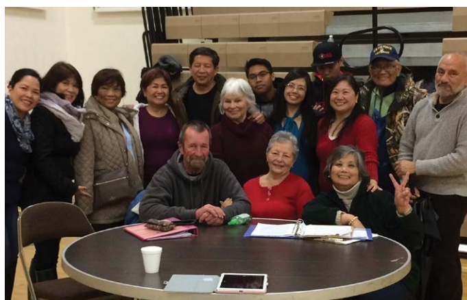
REST members at our parish helped out pre-COVID.