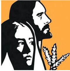
ST ISIDORE & ST MARIA DE LA CABEZA